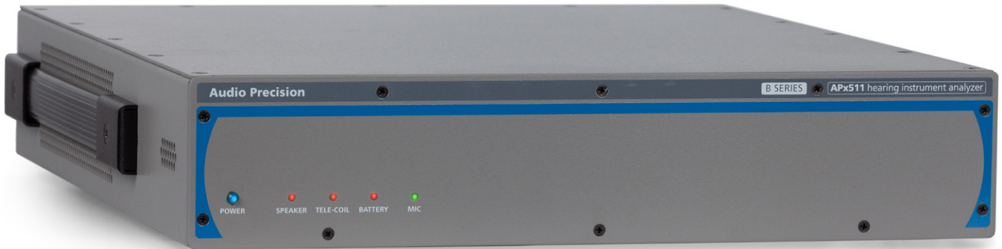
APx511 audio analyzer for hearing instrument production test

AP performance for hearing instrument production test