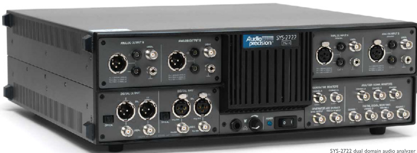
SYS-2722 dual domain audio analyzer

Extraordinary performance in a renowned audio analyzer