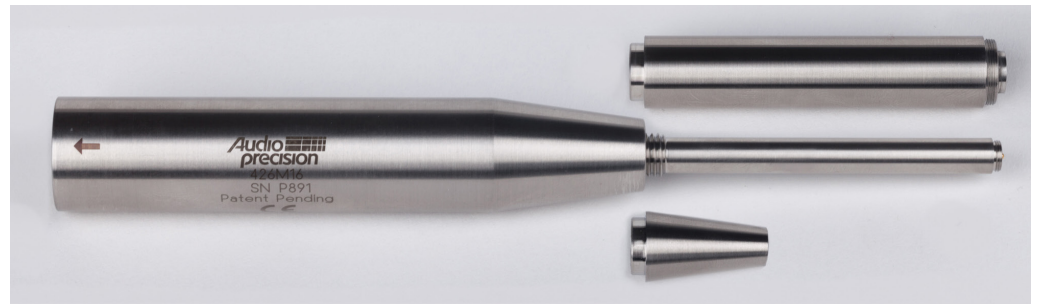
426M16 preamplifier components, which can be assembled for use with either ½" or ¼" mic cartridges.

With the 376M03 microphone system, we are introducing the 426M16: a flexible, phantom-powered preamplifier that can mount either ½" or ¼" standard IEC 61094-4 prepolarized microphone cartridges.