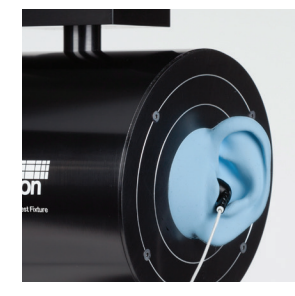
AECM206 shown testing circum-aural and supra-aural headphones, and intra-concha earbuds.