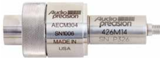
AECM304 WITH 426M14 PREAMP