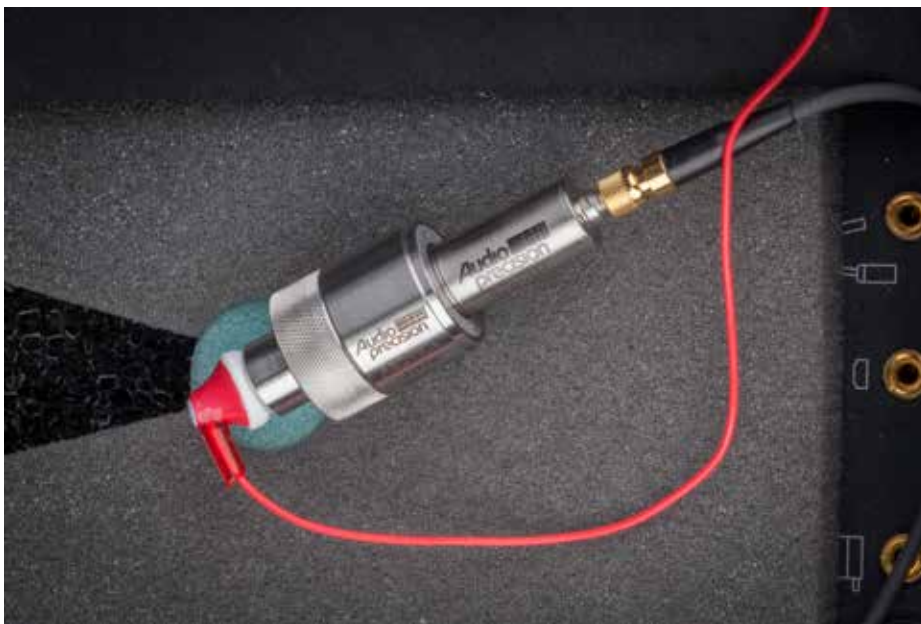
AECM304 IN TEST CHAMBER WITH EARBUD